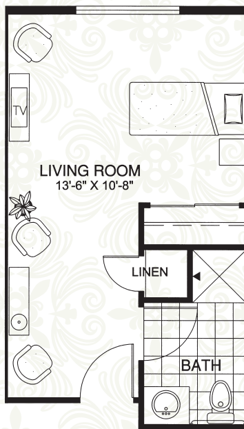
AZALEA 320 Sq. Ft.