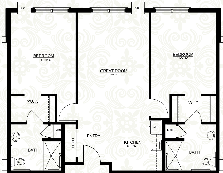
TWO BEDROOM 1052 Sq. Ft.